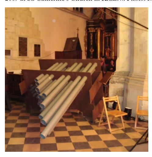
Figure 2. Tubaphone. Photo taken after Seven Gates of Jerusalem concert on 15 November 2009 at St. Catherine's Church in Kraków.

The composition is based on a text taken in its entirety from books of the Old Testament, above all verses from five of the Psalms of David (47, 95,